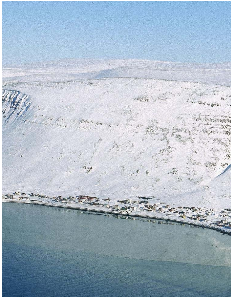
Figure 4. Klif.

The overall shape of the mountainside is convex but the potential starting areas are below the edge of the mountain Brellur where there are slight depressions in the mountainside.