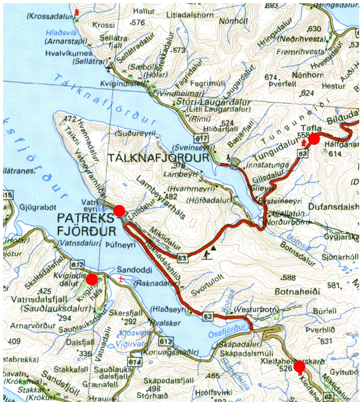
Figure 1. Overview of the area around Patreksfjörður. Meteorological stations are marked with red circles.