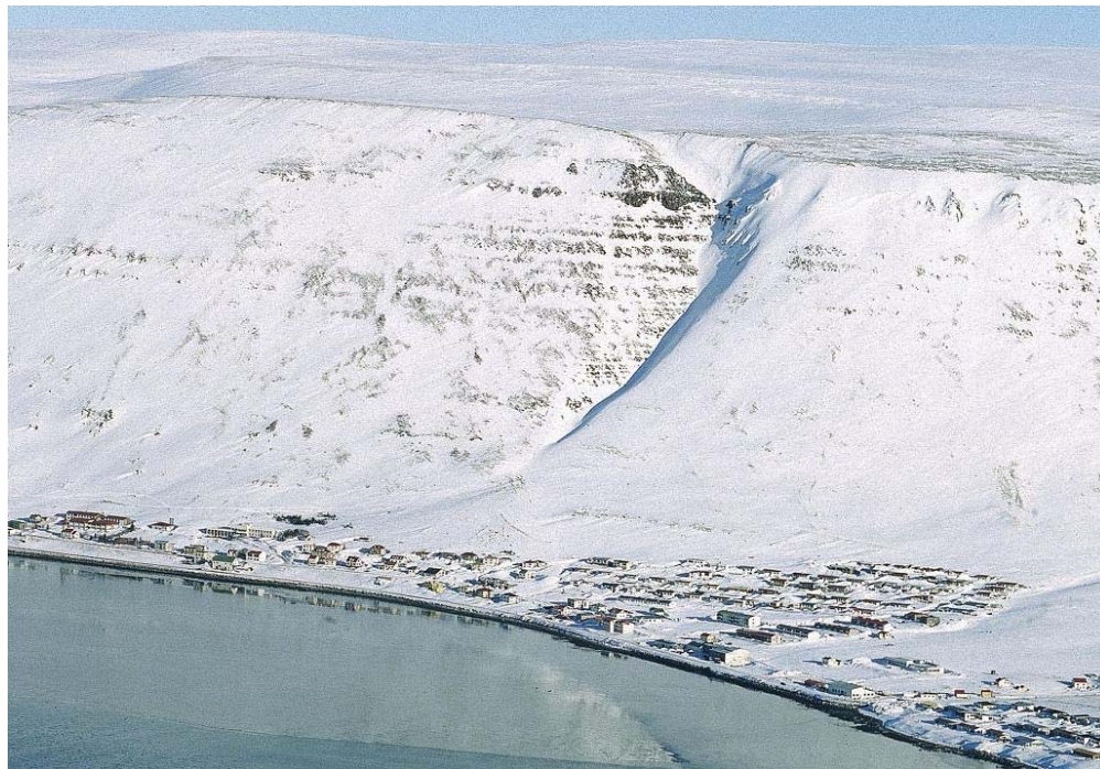
Figure 5. Geirseyrargil og Sigtúnssvæði (Photo: © Mats Wibe Lund).

Historically, the main hazard in this area has been due to slushflows which have caused fatal accidents and great material damage. There is also potential hazard due to avalanches which is described in this section.