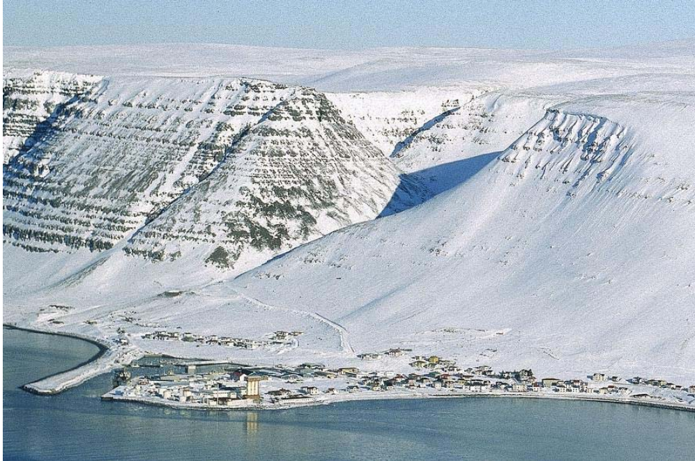
Figure 3. Vatneyri.

The area above Vatneyri can be divided into two subareas. The outer one is below the rim of Fjúsadalur and the inner one is the area of Urðir and the bowl above it.