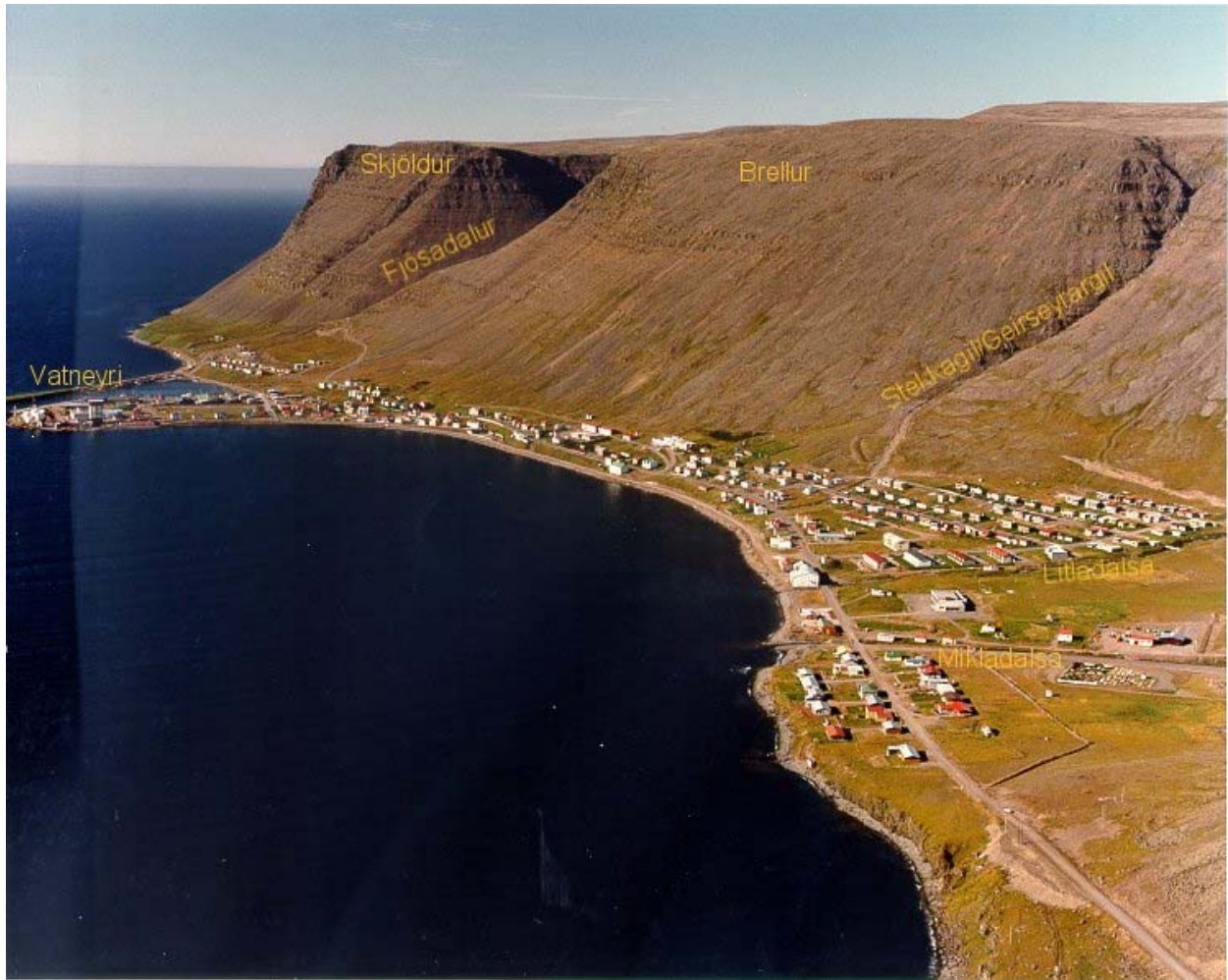
Figure 2. Patreksfjörður and the name of the main landmarks. (Photo: © Mats Wibe Lund).

The aspect hillside of the mountain Brellur is SW above Vatneyri. It changes gradually to S above the innermost part of the settlement. This generally convex hillside is cut by one large gully, Geirseyrargil below which there is a large debris cone. Inwards (SE) of the rim between the valley Fjósadalur and the fjord there is about 300 m wide bowl in the hillside. Below this bowl avalanche transported boulders and rockfall boulders are found in an area that is called Urðir.